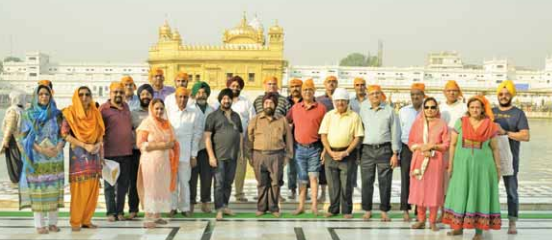
EC Members of FHRAI visiting The Golden Temple, Amritsar.