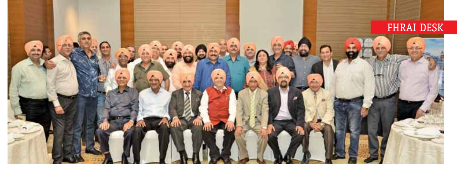
(Above) FHRAI and HRANI members at Amritsar.